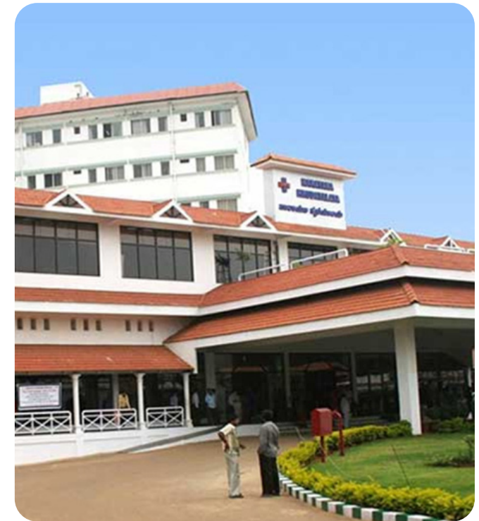
Narayana Hrudayala Hospital