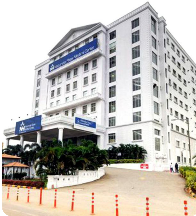
Mazumdar Shaw Medical Center